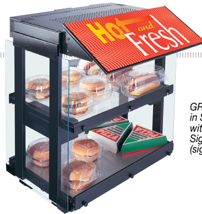
GRHW-1SGD in Standard Black with optional Sloped Front Sign Holder (sign not included)