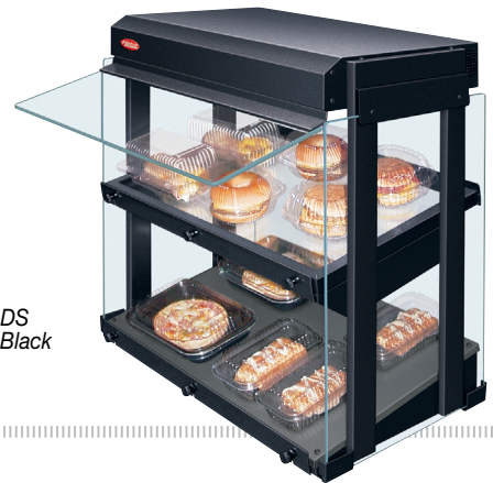
GRHW-1SGDS in Standard Black