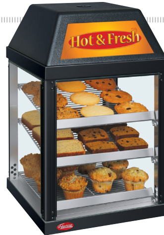
MDW-1X with standard Designer color and optional hood with backlit sign cut out on one side (sign included)