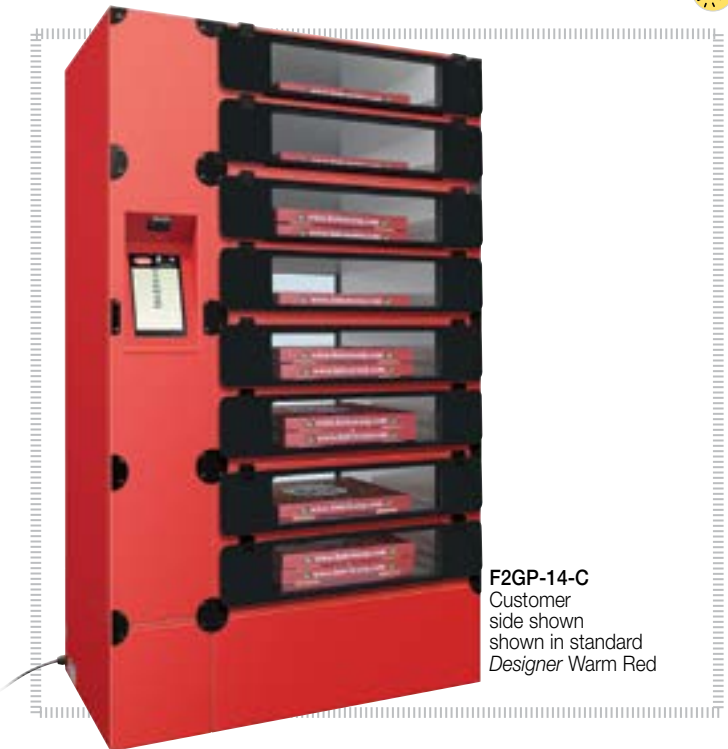
F2GP-14-C Customer side shown shown in standard Designer Warm Red