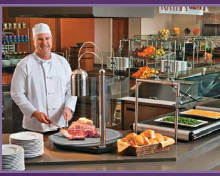
DCSB400-R24-1 with optional Gray Granite Simulated Stone base and standard Bright Nickel post and shade. Shown with GR2S-36 pg. 2