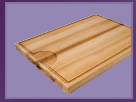
ACCESSORIES (CSCL-BOARD shown) pg. 3