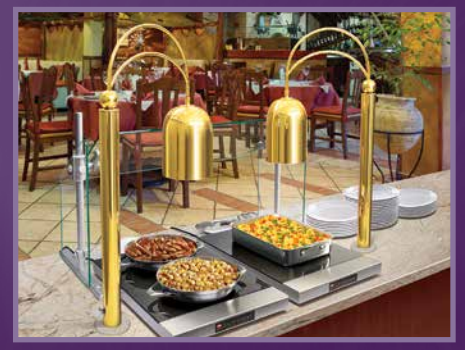
DCSB400-1CM models above HGSM-1P models pg. 2

Supermarkets & Delis Restaurants & Cafés • Clubs & Bars