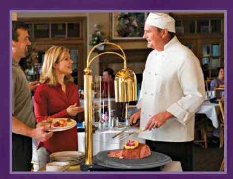
DCSB400-R24-1 with standard Night Sky Simulated Stone base and optional Bright Brass post and shade pg. 2