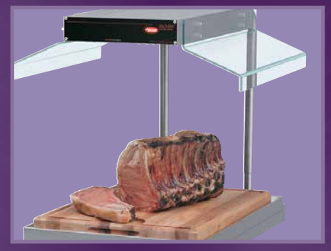
GRCSCL-24 with accessory left-hand sneeze guard, drip pan and cutting board pg. 3