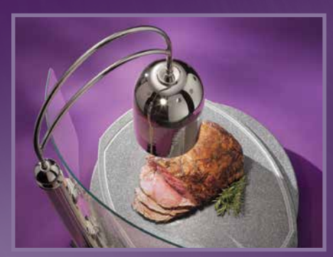
DCSB400-R24-1 with optional Gray Granite Simulated Stone base and standard Bright Nickel post and shade pg. 2