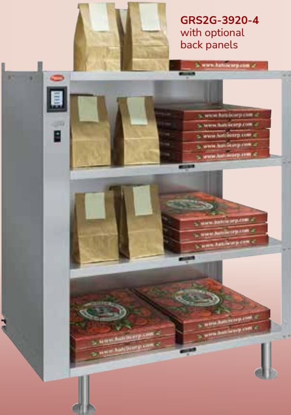
GRS2G-3920-4 with optional back panels