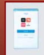
Optional touchscreen shown (Only available on MPP-8I units)