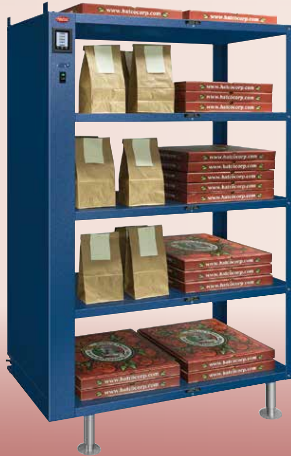
GRS2G-3920-5 in Designer Navy Blue