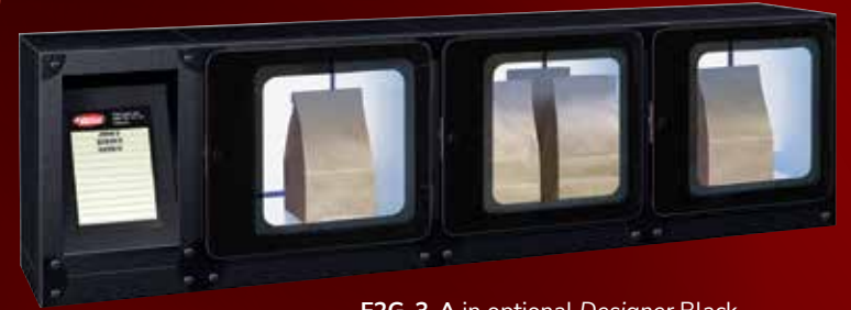
F2G-3-A in optional Designer Black (Customer side shown)