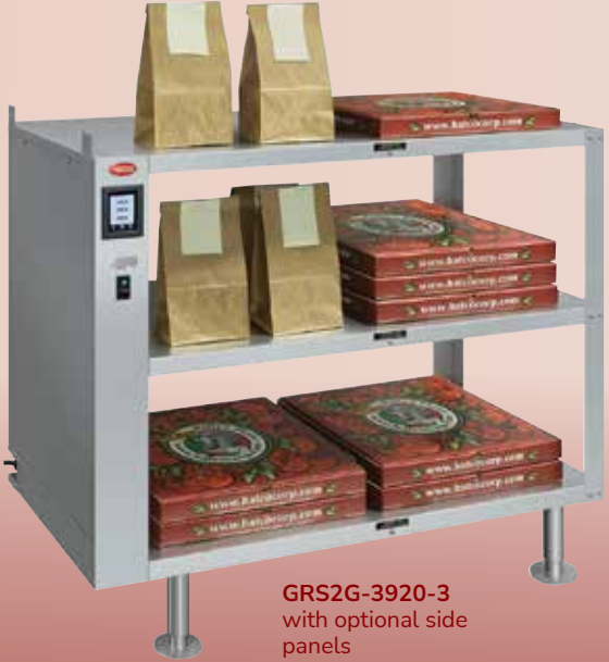
GRS2G-3920-3 with optional side panels