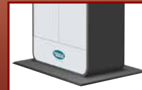
MPP-8I shown with Lily Pad accessory MPP-PAD2-57 in Charcoal