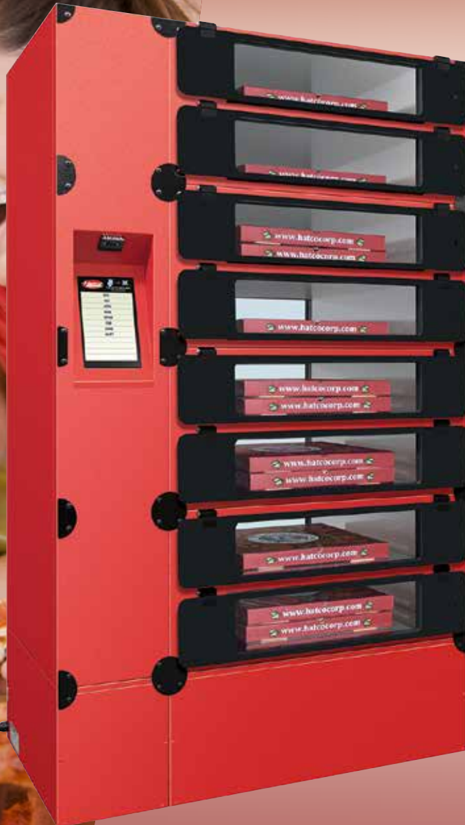
F2GP-14-C in standard Designer Warm Red (Customer side shown)