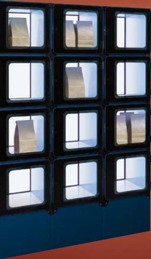
F2G-34-A in optional Designer Navy Blue (Customer side shown)