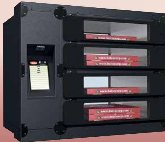
F2GBP-12-C in standard Designer Black (Customer side shown)