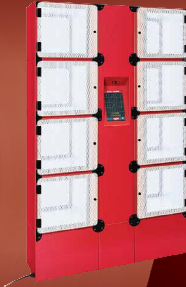
F2G-24-A in standard Designer Warm Red (Operator side shown)