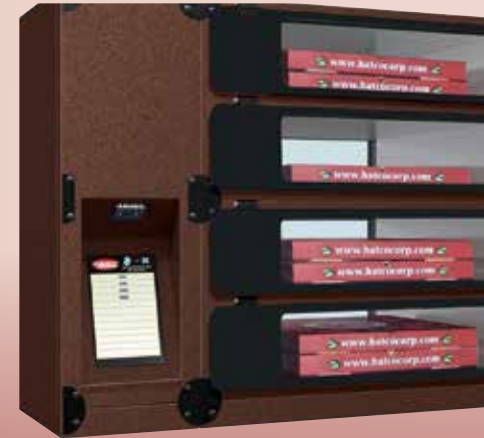
F2GP-12-C in standard Designer Antique Copper (Customer side shown)