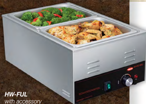
HW-FUL with accessory food pans and pan supports

Hatco Countertop Heated Wells hold food hot and fresh in either a wet or dry operation. The HW series are hold only, while the CHW series are capable of rethermalizing a variety of foods as well as holding (cook and hold). Both series offer a choice of two sizes in a rectangular unit.