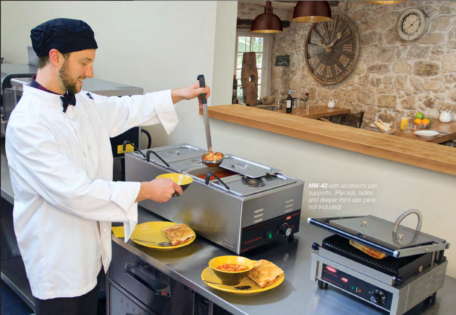
HW-43 with accessory pan supports. (Pan lids, ladles and deeper third-size pans not included)