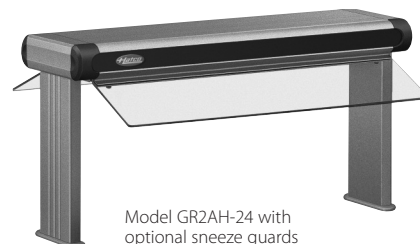
Model GR2AH-24 with optional sneeze guards