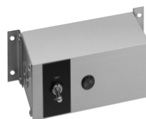
Model RMB-3F with infinite controls

METAL SHEATHED ELEMENTS GUARANTEED AGAINST BURNOUT AND BREAKAGE FOR TWO YEAR.