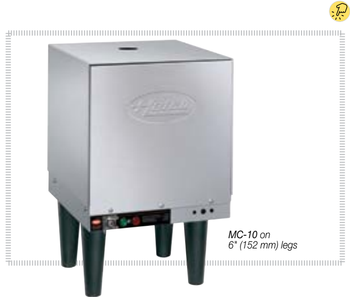
MC-10 on 6" (152 mm) legs