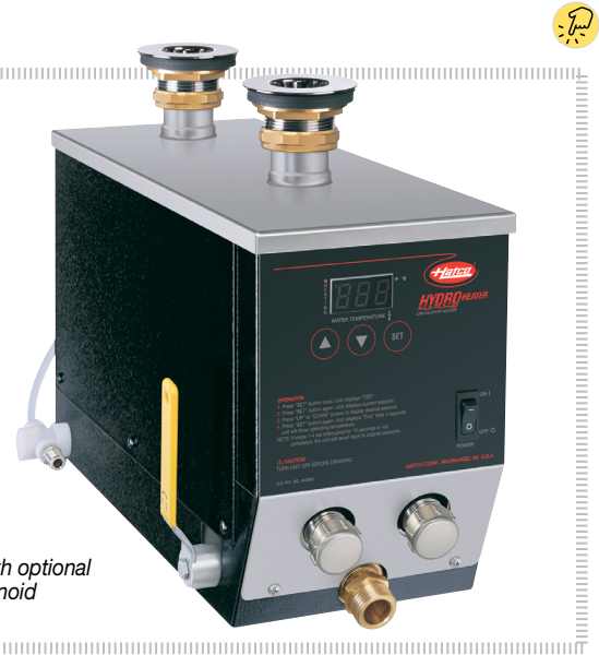
3CS2-3 Patented with optional auto-fill solenoid