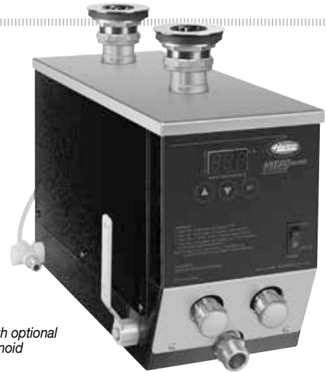
3CS2-3 Patented with optional auto-fill solenoid

Project _____ Item # _____ Quantity _____