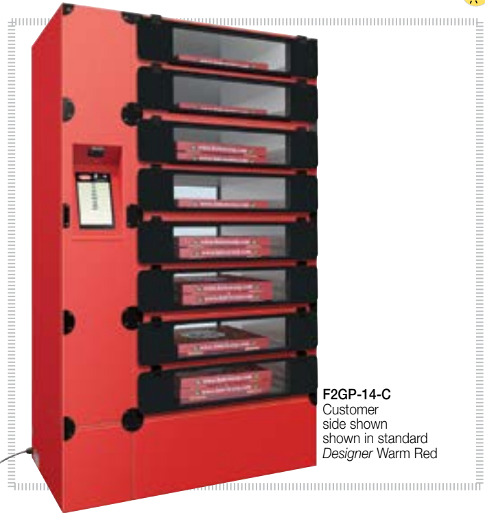
F2GP-14-C Customer side shown shown in standard Designer Warm Red