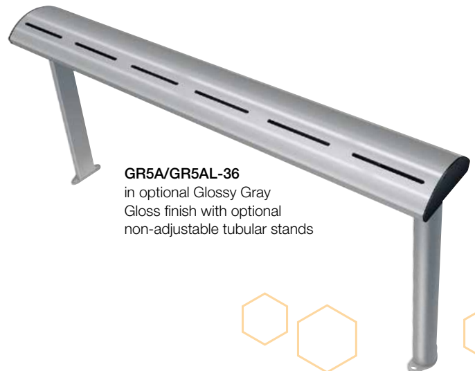
GR5A/GR5AL-36 in optional Glossy Gray Gloss finish with optional non-adjustable tubular stands