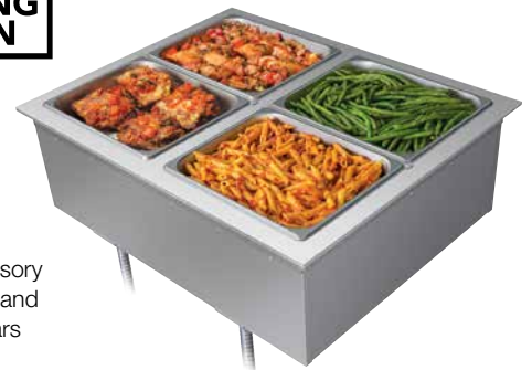
DHWBI-2 with accessory food pans and support bars