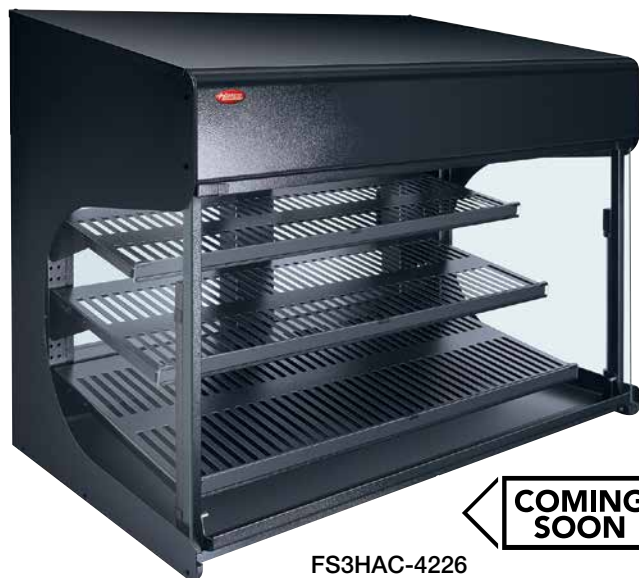
FS3HAC-4226 in standard Designer Black