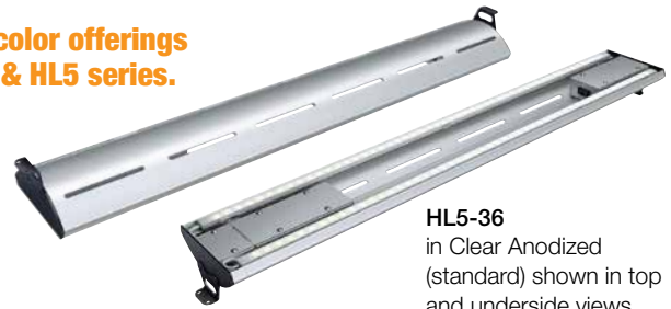
HL5-36 in Clear Anodized (standard) shown in top and underside views