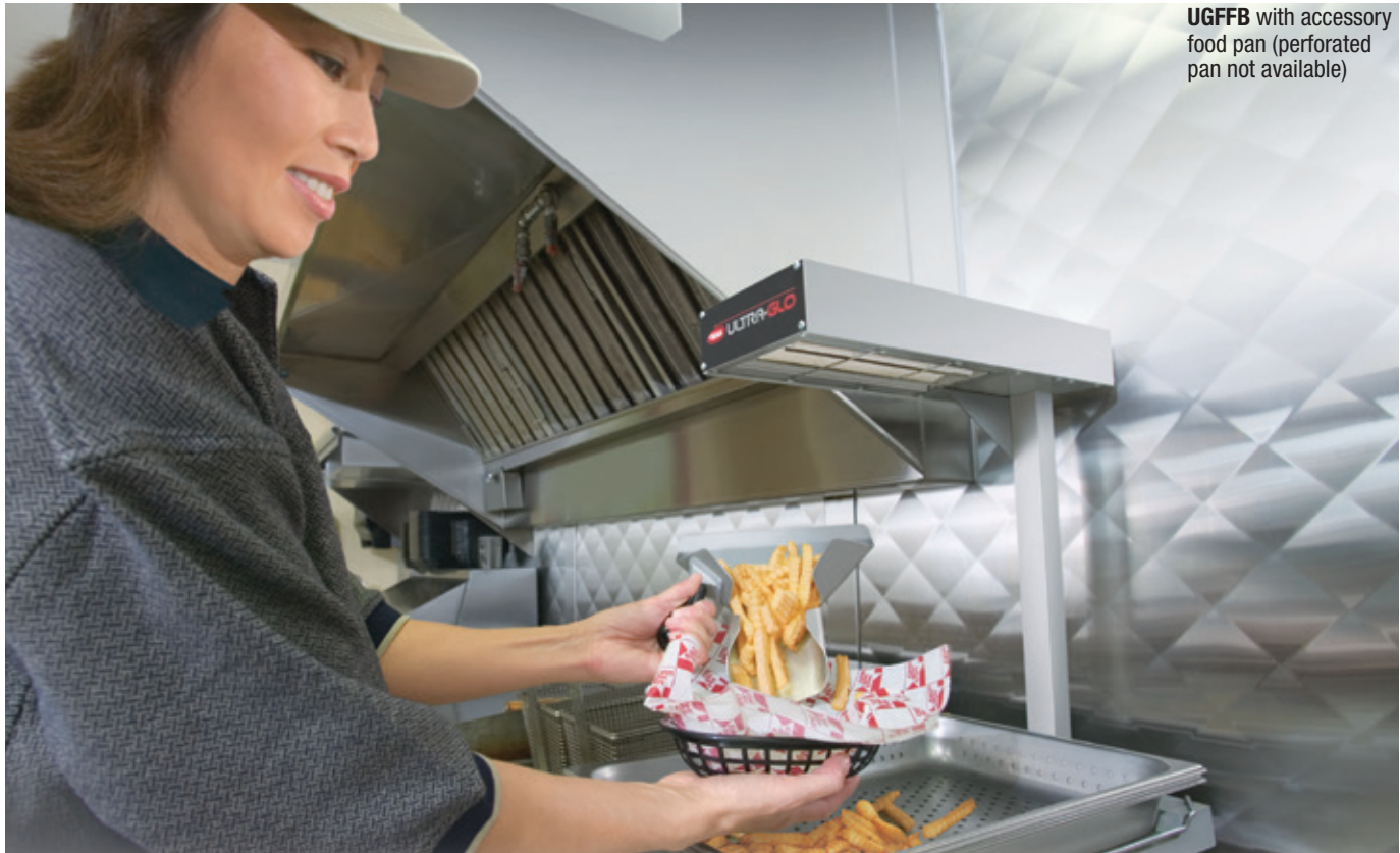
UGFFB with accessory food pan (perforated pan not available)