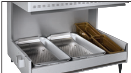
Shown with optional fry pans, and accessory angled riser and scoop holder (plastic food pans not available)