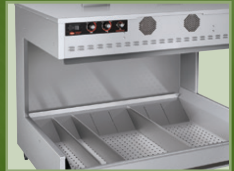
MPWS-36 shown with optional fry bin insert pg. 4