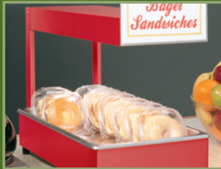
GRFFL with optional 9" display sign holder (sign not included) and Designer Warm Red color, and accessory food pan pg. 2