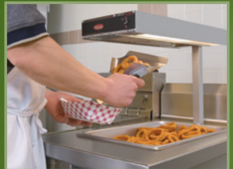
GRFSCL-18 with swing-away post mount and accessory food pan pg. 5