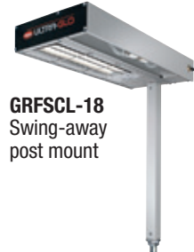
GRFSC-18 Swing-away post mount