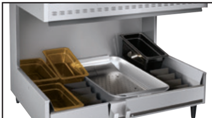
Shown with accessory fry ribbons on angled risers, fry pan and scoop holder (plastic food pans not available)