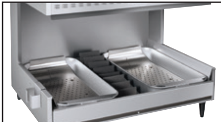
Shown with optional fry pans, accessory fry ribbon on angled riser and accessory scoop holder