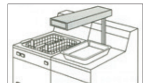
GRFS, GRFSL, GRFSC, GRFSL with swing-away post mount and cord with plug

Cord Location: GRFSC-18, GRFSL-18, GRFS-24 and GRFSL-24: Back, upper middle.