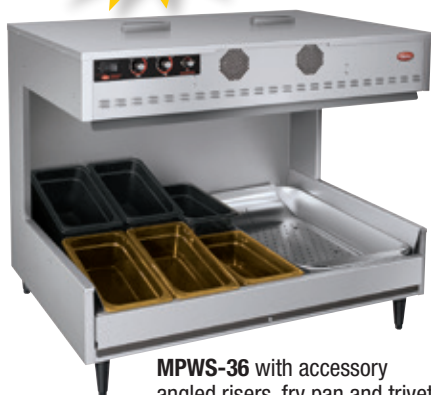
MPWS-36 with accessory angled risers, fry pan and trivet (plastic pans not available)