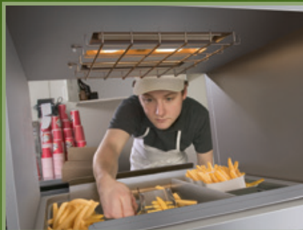
GRFHS-PTT21 pg. 5