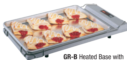
GR-B Heated Base with accessory sheet pan

Opt for the versatility of Hatco's Glo-Ray® and Ultra-Glo® Portable Foodwarmers. With heat from above, below or both, these foodwarmers offer design flexibility without sacrificing food product quality. Ideal for use next to fry stations, drive-through windows and service areas that require frequent and easy access.