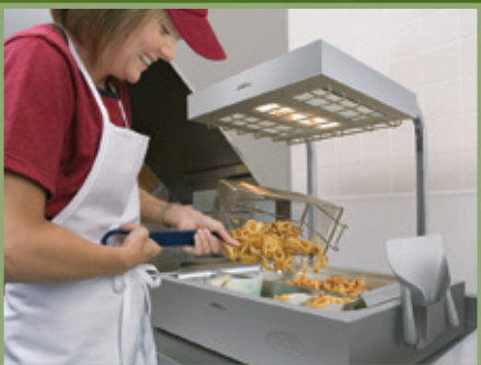
GRFHS-PT26 with accessory 8-pleat hardcoated fry box ribbon (scoop not included) pg. 5