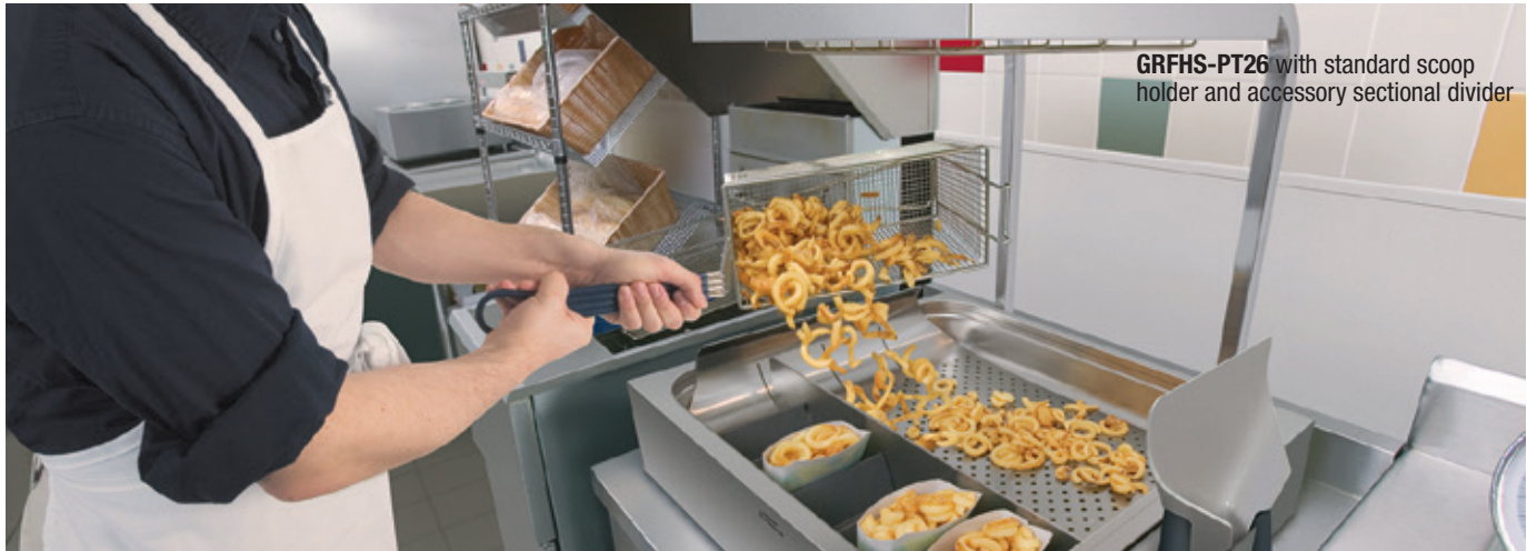
GRFHS-PT26 with standard scoop holder and accessory sectional divider