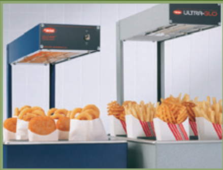
GRFF in optional Gloss finish Brilliant Blue and UGFF in optional Gloss finish Glossy Gray pg. 2

Supermarkets & Delis Restaurants & Cafés • Clubs & Bars