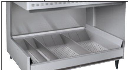
Shown with optional fry bin insert and standard detachable side panel on right side