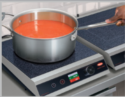
IRNG-PC1-36 in standard finishes pg. 2

Cafeterias • Buffets Supermarkets & Delis • Restaurants & Cafés Clubs & Bars