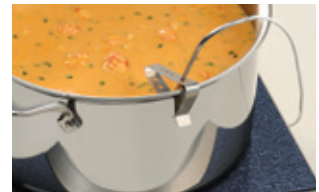
Includes a food temperature probe which facilitates highly accurate cooking