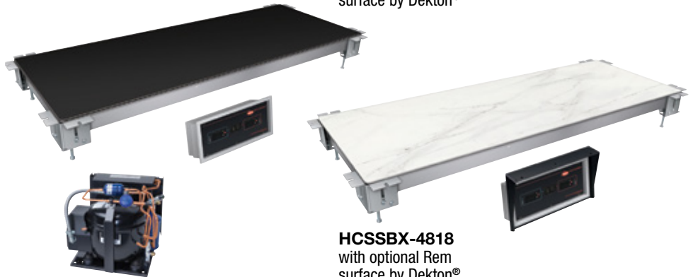
HCSSBR-4818 with optional Domoos surface by Dekton®