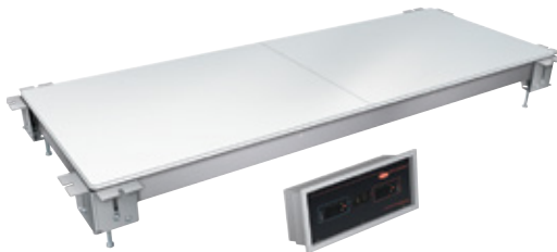
HCSSBR-4818 with optional white glass-ceramic top surface