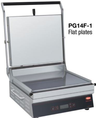
PG14F-1 Flat plates