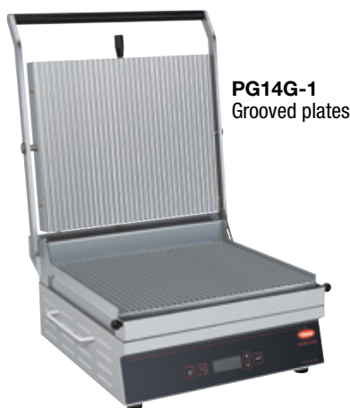
PG14G-1 Grooved plates