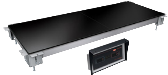
HCSSBX-4818 with optional black glass-ceramic top surface

Glass-ceramic top surfaces are now available in black or white on these models at no additional cost: