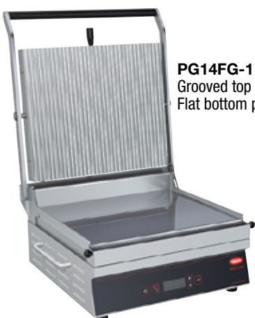
PG14FG-1 Grooved top plate, Flat bottom plate