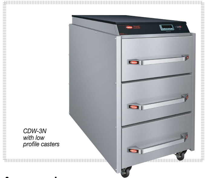
CDW-3N with low profile casters