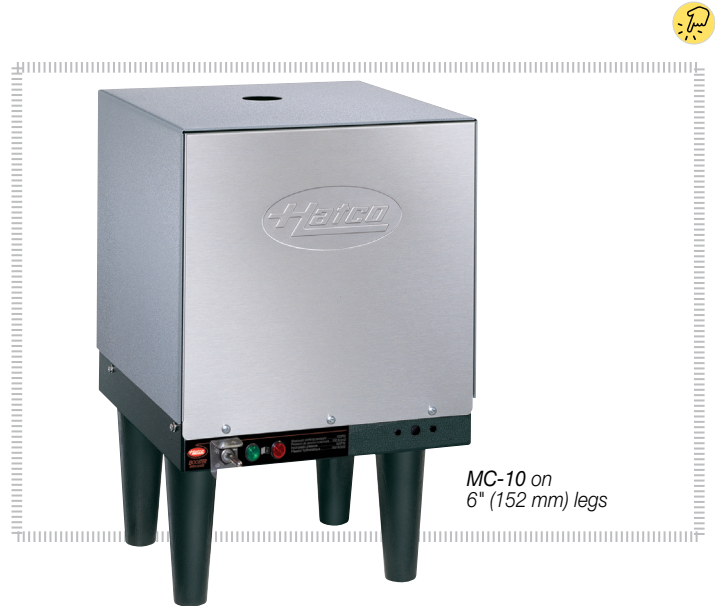
MC-10 on 6" (152 mm) legs