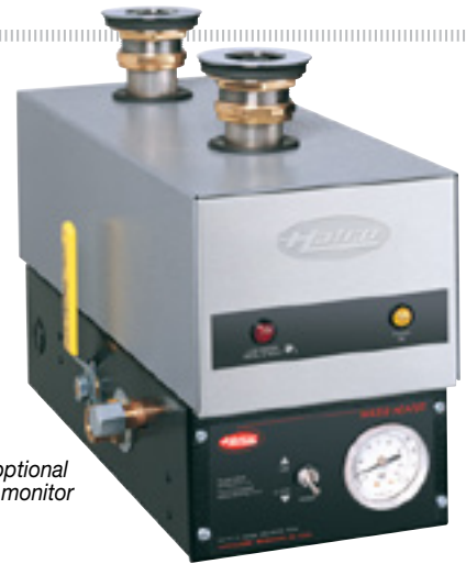
3CS-9 with optional temperature monitor