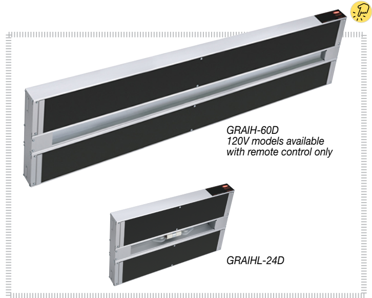
GRAIH-60D 120V models available with remote control only