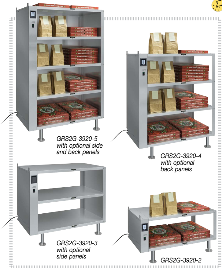
GRS2G-3920-5 with optional side and back panels